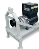
PTO GEN SET