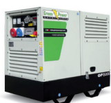
3000 RPM SOUNDPROOF GEN SET