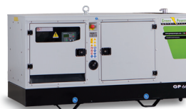
1500 RPM SOUNDPROOF GEN SET